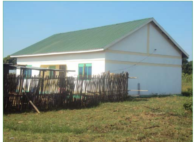
A side view of the new MRDA Guest house

Just a few yards away, meals are served hot in a gazebo-like dining room. A stone's throw away is a conferencing room and a community library ideal for workshops and research work in that order. At dinner guests have a chance to catch up with the latest news and to enjoy their choice programmes on DSTV.