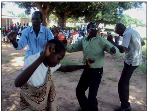
A youth group from Mundri West County provided comic relief for guests during the occasion.