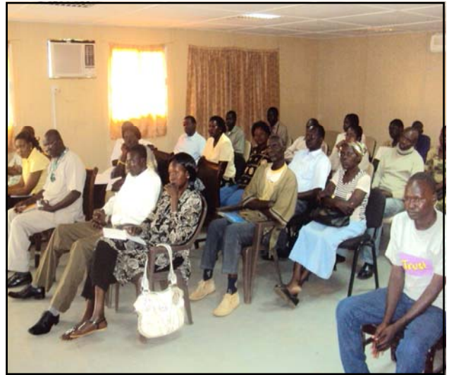
Guests listen intently to speakers at the White Nile Lodge, Juba during the launching ceremony of the booklets on HIV/Aids and Gender.