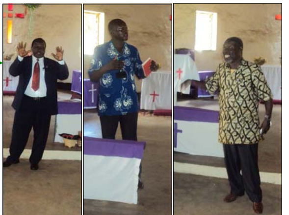
Invited guests pose with church leaders during a photo opportunity after the church fund-raising.