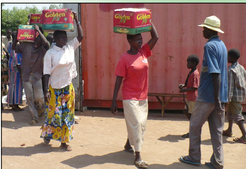
Some of the affected victims carrying food to the point of distribution

The food ration which included maize flour, rice, beans, cooking oil, sugar, tea leaves and iodised salt was for one