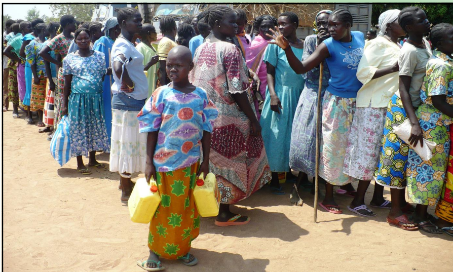
Some of the Internal Displaced People (IDPs) by LRA rebels line up for relief food by MRDA

targeted the most vulnerable population benefited 21 percent of the IDPs.