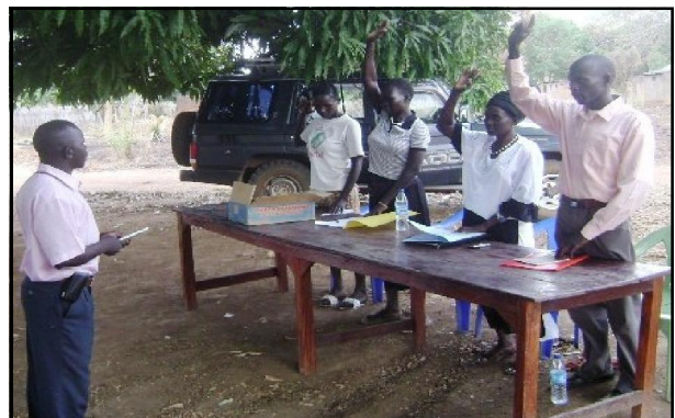
Participants simulating the election process. They are swearing as electoral officers.

Key topics covered in the training included importance of election, electoral law and election process. The training ended in simulated election campaigns, polling and result announcement. For most participants this was