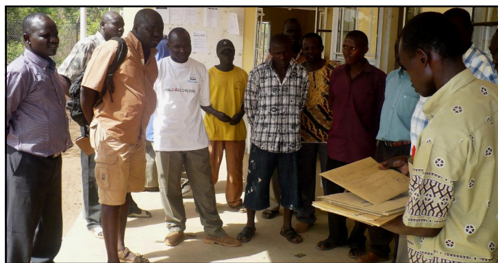
MRDA Field Accountant publicly opens the bids for school construction

In the event that the construction works are not completed on sched-