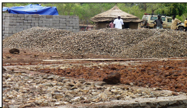
Construction going on at Lunjini Primary School, Kediba Payam, Mundri East

"We expect the schools to be completed by end of August this year," he added.